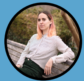
Author photo by Sammie Correa