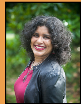
Author photo by Linda Wang Photography